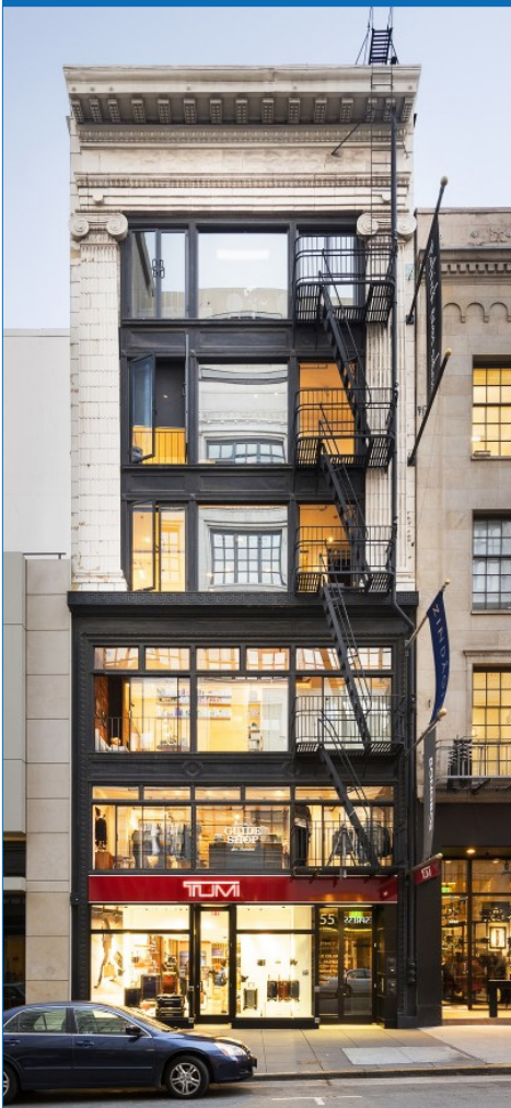
San Francisco, Grant Avenue